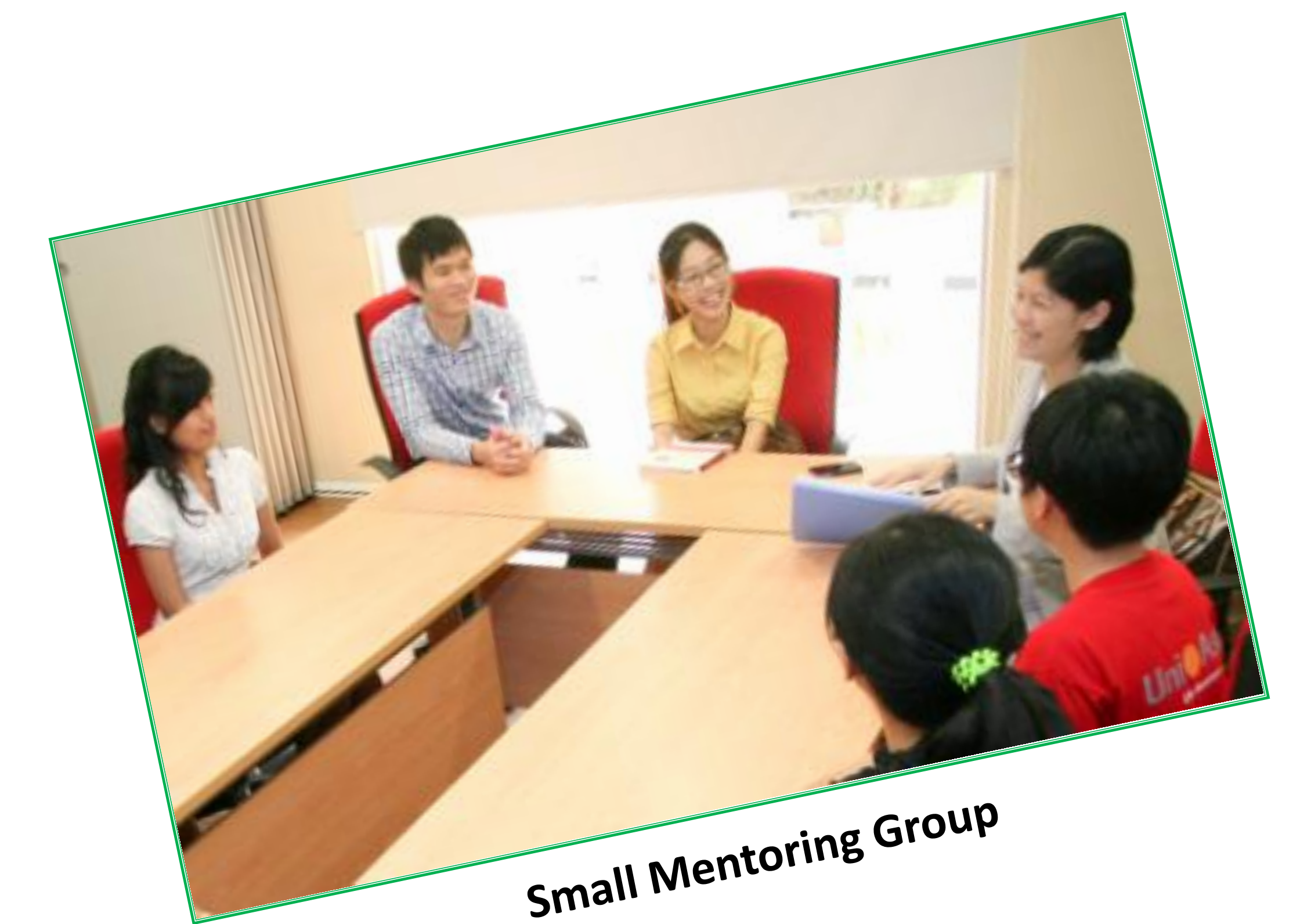
Small Mentoring Group