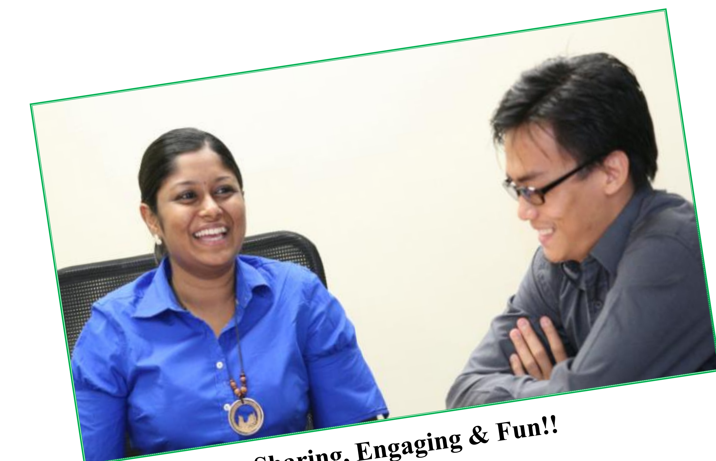
Sharing, Engaging & Fun!!