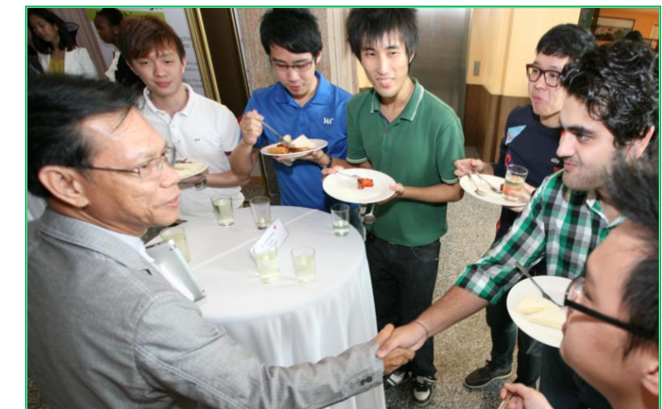
Networking Tea Session